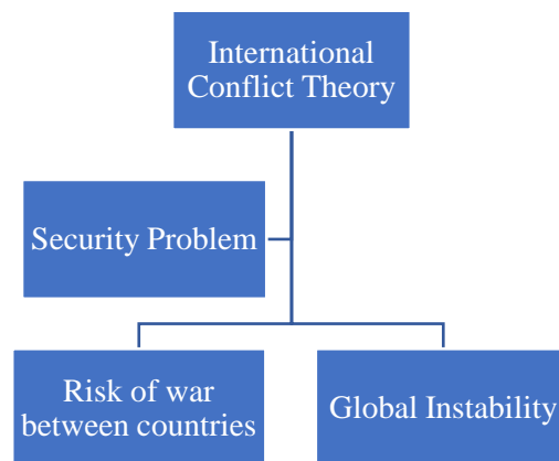
Figure 2. Indicator of Internasional Conflict Theory

Nationalists support the use of force to protect their land and people from foreign threats. Research on nationalism in international conflicts explores the roles of elites, the general public, and the political dynamics between these groups, highlighting its role as a factor that increases the likelihood of war between nations. (Powers & Ko, 2024, p. 1). The Nationalists encouraged the use of their power to protect the homeland and its people against foreign threats.